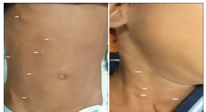
Figure 1: Multiple cutaneous nodules over abdomen and neck of cutaneous cysticercosis (white arrows)

Even after the control of status epilepticus, the child continued to show altered sensorium with Glasgow coma scale of 5 (E1V1M3). A contrast enhanced computerized tomography (CT) scan of the head was obtained. CT revealed multiple small, contrast enhancing lesions involving entire brain parenchyma forming the characteristic ‘starry-sky’ appearance seen in NCC (Fig. 2). A fundus examination was also done, which revealed papilledema in both the eyes, no cysts were visualized. In view of the classical neuroimaging and clinical findings, a diagnosis of cysticercal encephalitis with disseminated cutaneous cysticercosis was made.