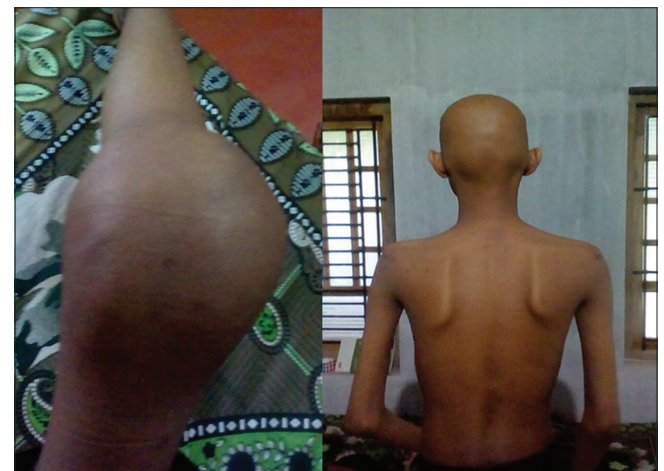
Figure 3: Clinical photograph, post chemotherapy and radiotherapy

pseudotumors and soft tissue sarcomas may be similar and difficult to differentiate. The MRI helps in coming to a final diagnosis.