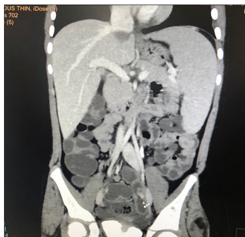
Figure 3: Computed tomography of abdomen reveals multiple hemangiomas in liver, small and large bowel

in reducing bleeding or in permanently controlling blood loss. To date, there are no clinical studies comparing these different treatments. It is important to report more cases in order to know