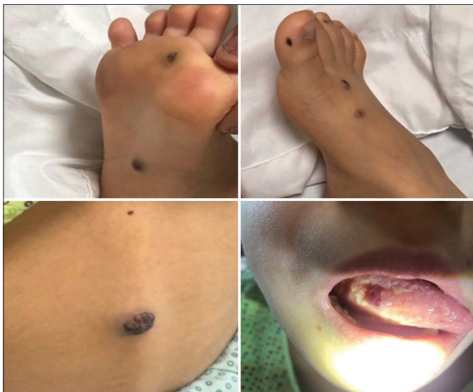
Figure 1: Nevi seen on feet, back and tongue respectively in BRBN