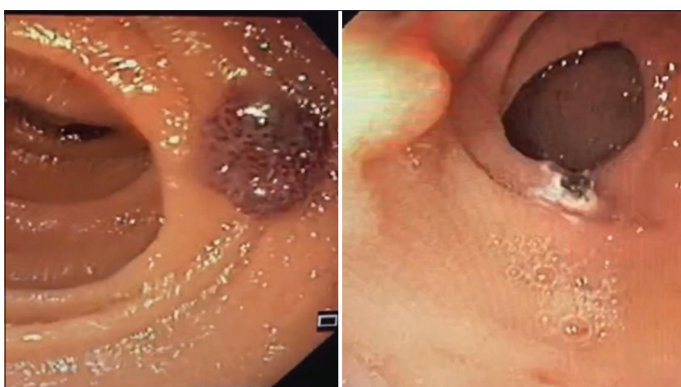
Figure 2: Nevi seen on endoscopy pre and post argon plasma coagulation