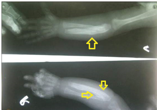
Figure 1: X-ray of forearm bones showing subperiosteal reaction of right and left ulna

Review after 10 and 48 months showed a healthy child with no recurrences and the X-ray findings revealed bone remodeling.