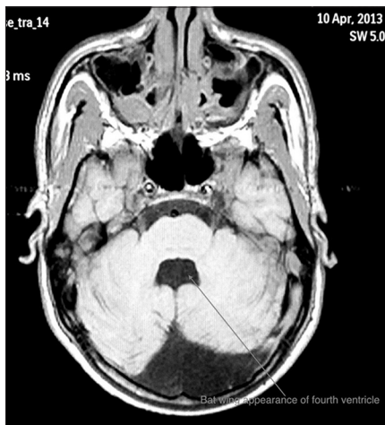
Figure 3: Axial T1-weighted image showed “bat-wing” appearance of the fourth ventricle