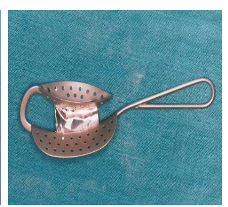
Figure 1: Bite trays: cardboard impression tray, Figures 2 and 3: The occlusion spoon with concave lateral edges and the presence of lateral slits