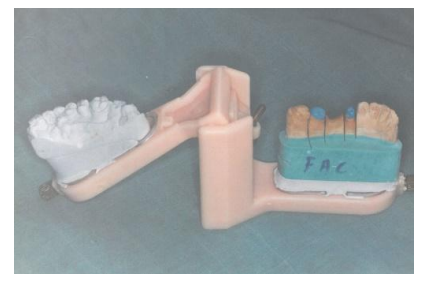
Figures: Figure 7: Footprint of the antagonist sector, Figure 8: Milled cavity impression casting, Figure 9: Work model and its antagonist on occlusor.