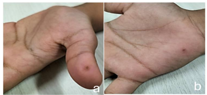
Figure 3 (a, b). Warts on the palm before the treatment

Within two to three weeks of treatment, the warts dried and detached spontaneously without scarring or callosity. After a follow-up of ten years, the patient reported no recurrence of warts (Figure 4).