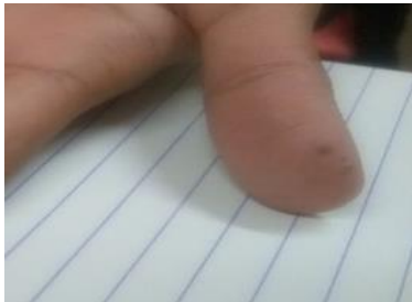
Figure 5: Warts before treatment.