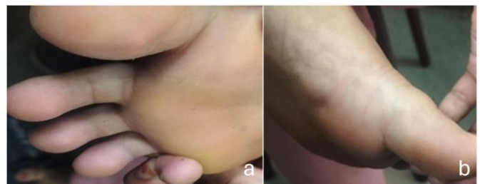
Figure 2 (a, b): Complete resolution of lesions after individualized homeopathic treatment.