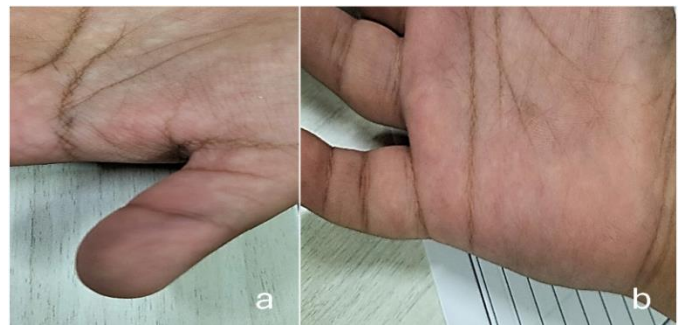
Figure 4 (a, b): Complete resolution of lesions following treatment.