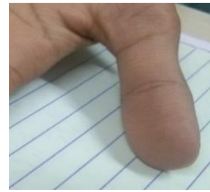
Figure 6: Complete clearance of lesions after treatment.

Within one month, one wart dried and fell off spontaneously. Over the subsequent two months, all remaining warts, including periocular lesions, resolved completely without scarring (Figure 6). The patient also reported improvement in confidence, reduced anxiety, and better overall well-being.