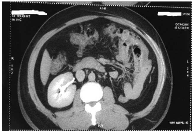
Figure 2: Dilated left ureter