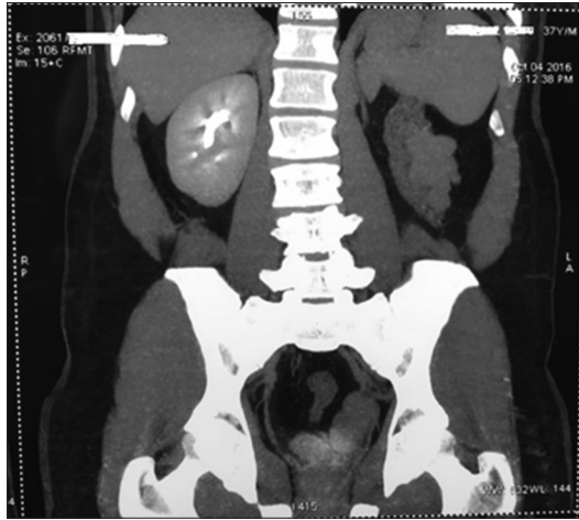
Figure 1: Left renal agenesis