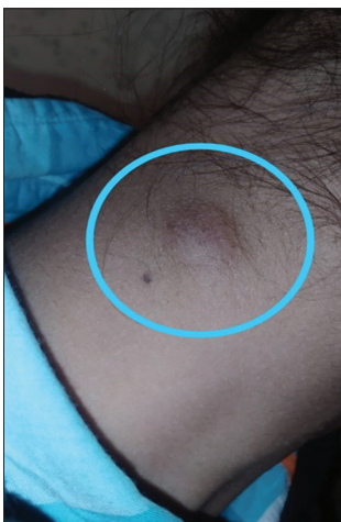
Figure 1: Enlarged cervical lymph node

Since the introduction of the various hydantoin derivatives and analogs into the therapy of convulsive disorders, scattered reports